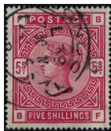
Lot # 471