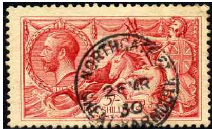
Lot # 410