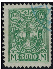
Lot # 451