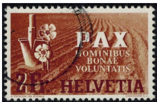
Lot # 33