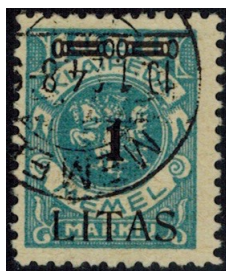
Lot # 294