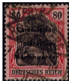
Lot # 193

192. *o 500± diff, Barbuda only, packet, F/VF..... $ 650.00