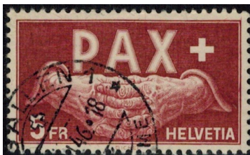
Lot # 35