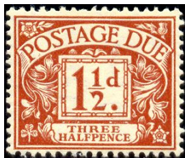
Lot # 59